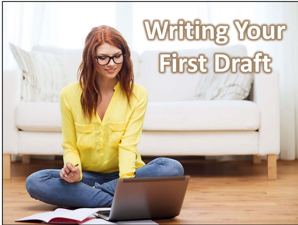
Writing Your First Draft