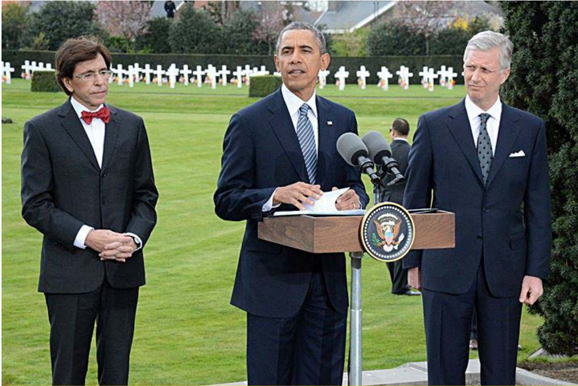
Prime Minister of Belgium Elio Di Rupo (left) and King Philippe of Belgium (right) with President Barack Obama in 2014.

The government in Belgium is a Federal Parliamentary Constitutional Monarchy. That means there is a king or queen as the head of state. The king or queen reigns, but does not actually govern. That responsibility is left to the Federal Parliament and the Prime Minister. Like Switzerland, Belgium takes a neutral stance when it comes to world politics. This led to problems during World War II, when Germany used Belgium as the path for invading France.