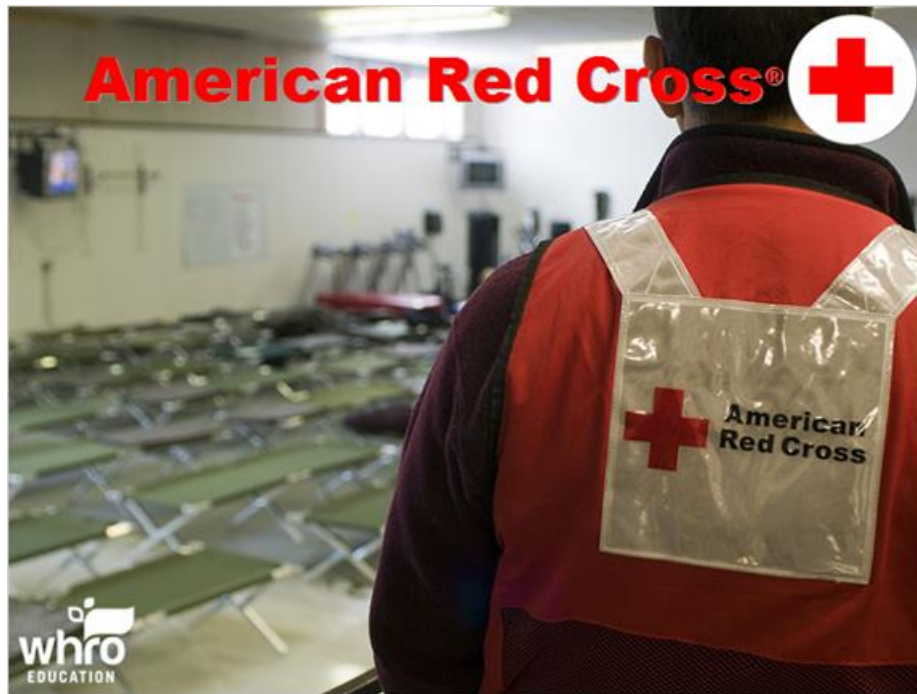
American Red Cross®