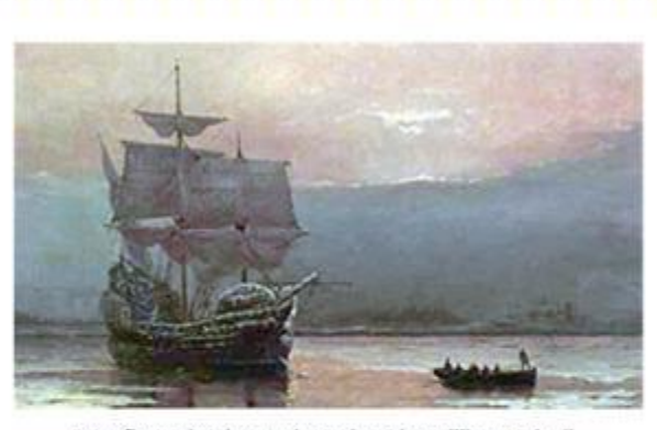
"Mayflower in Plymouth Harbor" by William Halsall

Arriving in New England first were the Pilgrims, a group of separatists. Most of these Pilgrims had sought religious refuge in Holland before the voyage to the New World. The Pilgrims were primarily common people with little education or wealth. The Pilgrims obtained a colonial charter, boarded the Mayflower , and arrived in the New World in 1620.