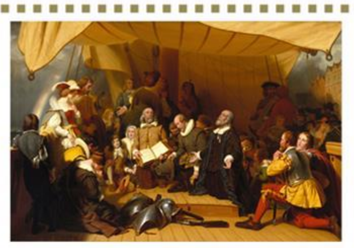
"The Embarkation of the Pilgrims" by Robert Walter Weir

Before departing the ship, the Pilgrim men signed the compact, establishing a covenant community. Laws approved by the majority would be binding to both Pilgrims and non-Pilgrims.