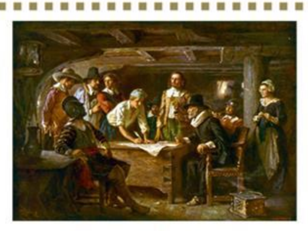
Signing the Mayflower Compact 1620, Jean Leon Gerome Ferris

The colonial charter was not valid in Massachusetts. In response, the Pilgrims drafted the Mayflower Compact. In this agreement, the Pilgrims created a civil government and pledged loyalty to the King of England.