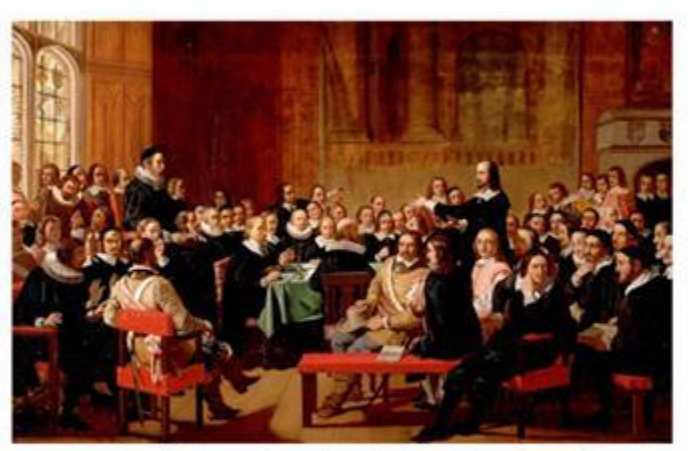
Assertion of Liberty of Conscience by the Independents of the Westminster Assembly of Divines, John Rogers Herbert

Another groups of separatists, the Puritans, sought to purify the existing Church of England through reforming the church from within. The Puritans wished to remain loyal to the Church of England. Puritans were a hardworking people who believed in faith, prayer, and Bible study.