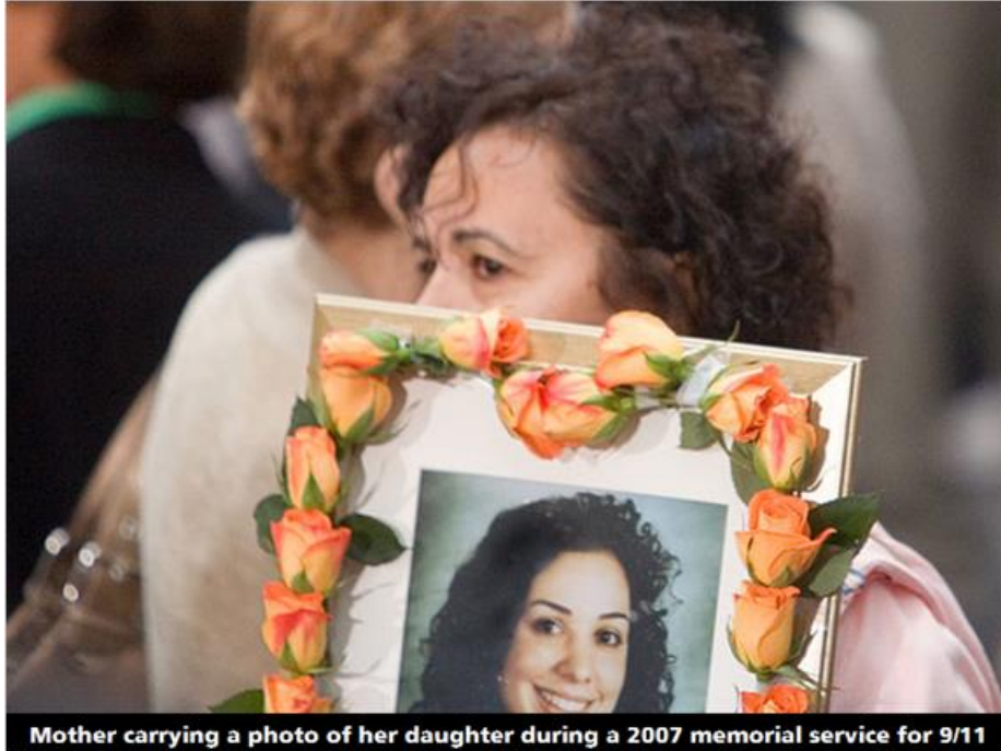
Mother carrying a photo of her daughter during a 2007 memorial service for 9/11

"Terrorist attacks can shake the foundations of our biggest buildings, but they cannot touch the foundation of America. These acts shatter steel, but they cannot dent the steel of American resolve."