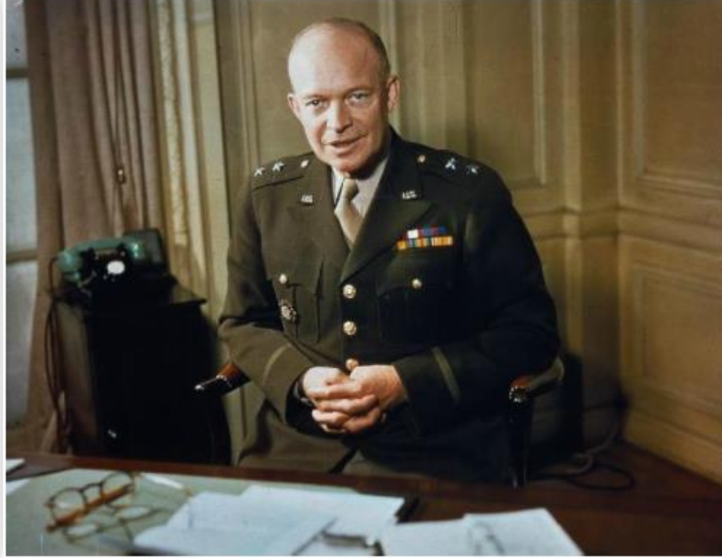
Dwight D. Eisenhower entered the Presidential race in 1952, and won by campaigning against communism, and promising to resolve problems from the Korean War.

Dwight D. Eisenhower entered the Presidential race in 1952, and won by campaigning against communism and promising to resolve problems from the Korean War.