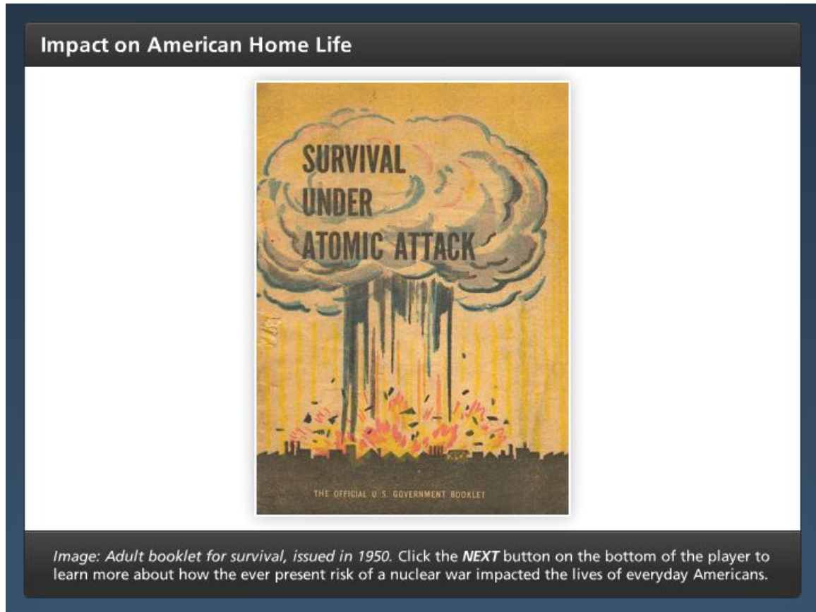
Image: Adult booklet for survival, issued in 1950. Click the NEXT button on the bottom of the player to learn more about how the ever present risk of a nuclear war impacted the lives of everyday Americans.