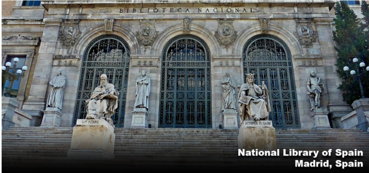
National Library of Spain Madrid, Spain

Cities offer access to schools, libraries, and museums