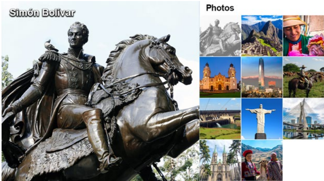
This statue of Simón Bolívar is located in Caracas, Venezuela. Bolívar was a military and political leader who overthrew Spanish rule in modern day Venezuela, Colombia, Ecuador, Peru, Bolivia, and Panama.